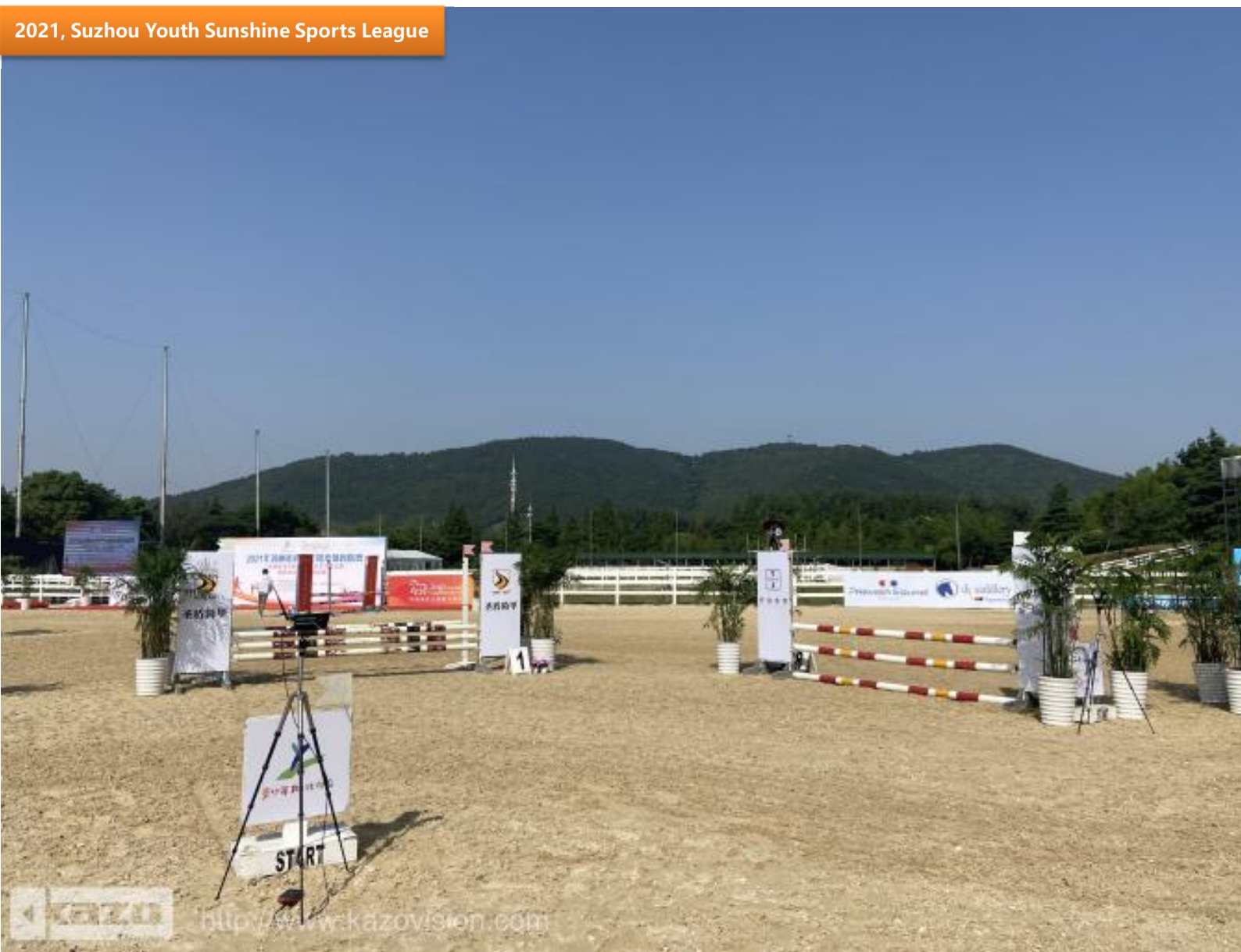
2021, Suzhou Youth Sunshine Sports League

This is a general solution for LED display in Cross Country stadium which has the functions of timing, scoring and displaying advertisement, notification, the information of order, score and result. It is an ideal choice for most of stadiums.